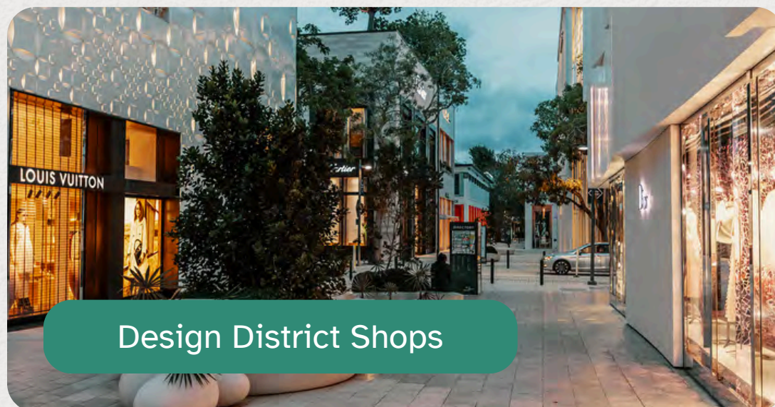
Design District Shops