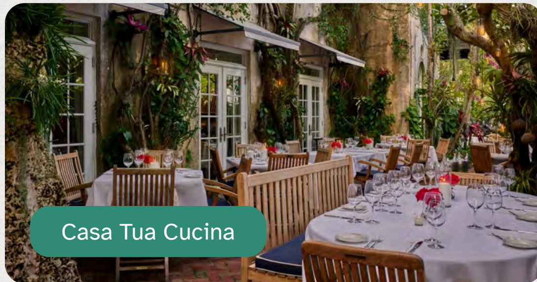
Casa Tua Cucina

MILA connects you to a new Miami: curated, elevated, and elegant. From Bal Harbour's designer boutiques to serene spa rituals and world-class cuisine, everything is within effortless reach.