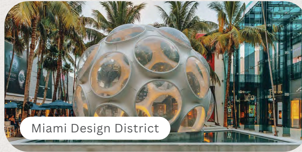
Miami Design District

The Miami of today presents a more intricate landscape. It's lively yet rooted. Mila serves as a bridge to these two worlds. Located just minutes from the vibrancy of Wynwood, the fashion of the Design District, and the bustling business core of Brickell, you can retreat to a home that offers tranquility, nature, and ample space.