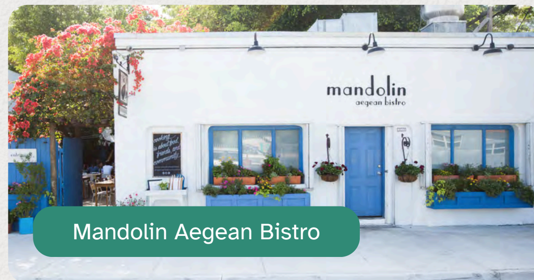
Mandolin Aegean Bistro