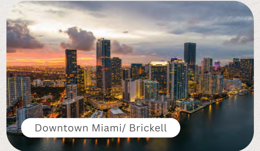
Downtown Miami/ Brickell