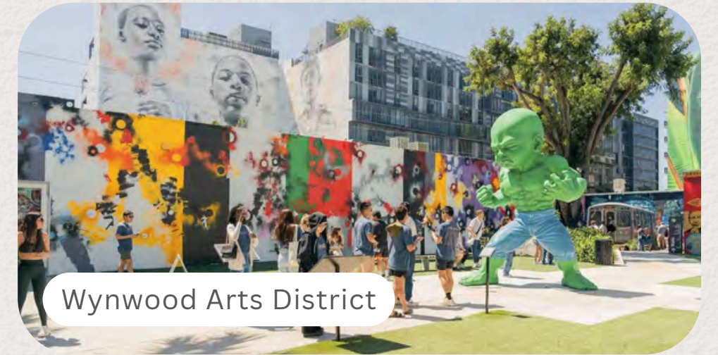
Wynwood Arts District